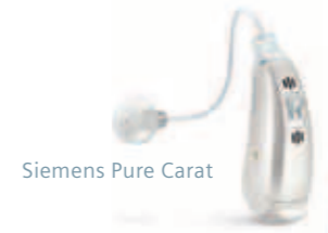
Siemens Pure Carat

One of the key factors for treatment is learning to control the tinnitus – rather than being controlled by it. Many tinnitus treatments such as habituation or masking involve the use of an external acoustic training device. The Siemens portfolio includes specialized tinnitus solutions. Siemens Life and Pure Carat™ are two of our new generation hearing instruments that support patients with tinnitus, giving them a great sense of relief.